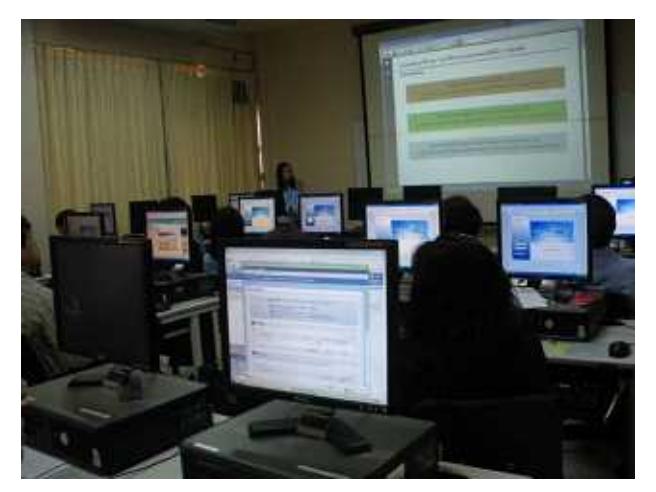
NWTTI, at room of the coach training course (April 23, 2009)

Last year, TICA (Thai International Cooperation Agency) and JICA Thai office worked together to restart the third country training for the neighbor countries. This year is the 10<sup>th</sup> anniversary of the JICA project's end, therefore, MWA are planning to cerebrate it extensively with former experts.