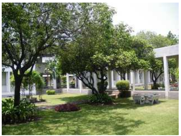
Campus of NWTTI (April 23, 2009)

In MWA, JICA technical cooperation projects have implemented two times from 1985 to 1992 and from 1994 to 1999. (It was called "project type technical cooperation" at that time.) It was the first JICA project in water fields. In the project, PWA and MWA organized NWTTI (National Water works Technology Training Institute),and established the central center in Bangkok and local center in Khon Kaen and Chang Mai, which are built by Japanese grant aid. And at phase 2, once a local center was established by the Thai funds, there have been 4 training centers in total.