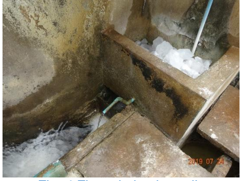
Fig. 4 Flocculation in reality

On the other hand, water source has to be careful. The water source of Khoksi, the model district of the project, is Loeng Lake. Cattle, buffaloes, horses, etc. are grazed on the lake