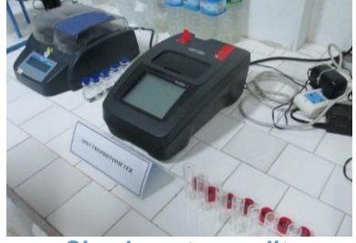
Simple water quality monitoring equipment in MCDC lab