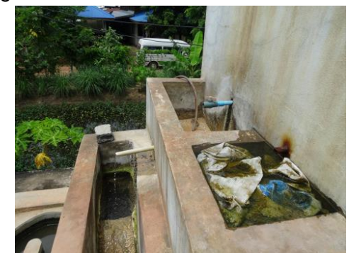
Fig. 3 Water purification plant full of garbage

It is strange that flocks are formed in the manner described above. Is this flocculant considered to have a wide flocculable range? In other words, the managers who should properly manage the water purification plants in the villages are currently purifying water without knowing the purification theory and the proper operations. Against this background, we are keenly aware of the need for managers to know the correct water purification theory and to train proper operations. This has been a major motivation and objective for the project. If this goal is achieved, we believe that safe tap water can control the diseases before the villagers visit the medical institution, and that it will provide the villagers with a wellbeing life.