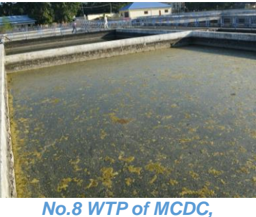
algae in receiving tank

Most people may frighten the greenish algae