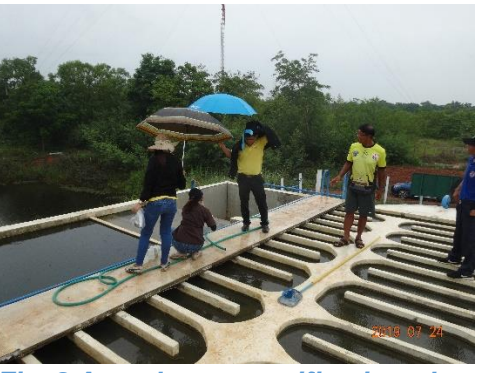
Fig. 2 Actual water purification plant