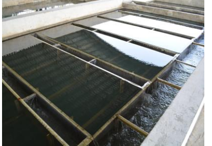
Well-functioning settled water collecting basins, No.4 WTP in the conversion of Mandalay

the safe water supply will be possible in the near future.