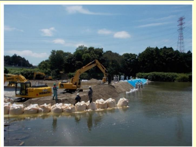
Construction work of the temporary soil dike in Kuji River

The water utility in Hitachi City takes water from two sources, the Kuji River and the Juo River, and treats them separately. The intake point of the Kuji River is 4.3km upstream from the river mouth. Under the influence of recent abnormal weather, the river water level drops during low rainfall and seawater goes up and reaches the intake. In that case, the water utility stops water intake temporary. If such a situation is prolonged, they construct a temporary dike on the downstream side of the intake to narrow the river width for strengthening the flow from the upstream and prevent seawater from running up. Furthermore, stable water supply is ensured by partially utilizing water from the Juo River system. (*Quoted from Hitachi City Water and Sewerage Business Management Strategy 2018)