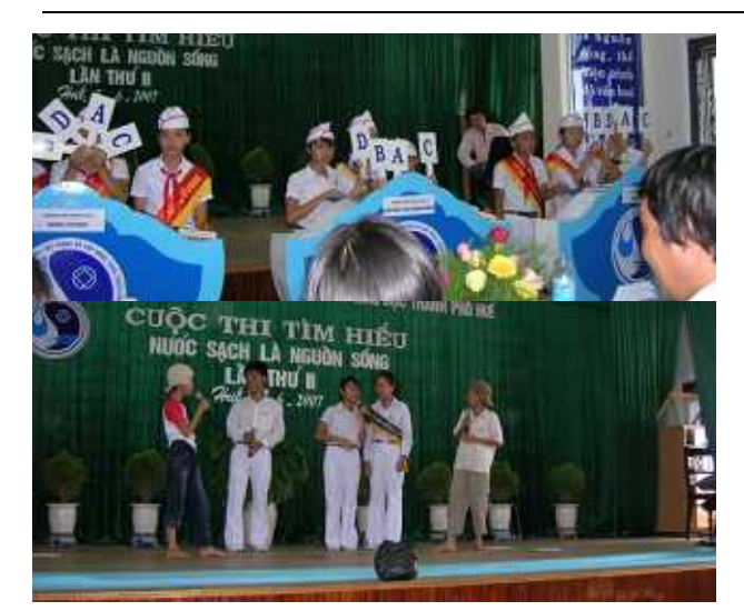
Competition by schoolboys and girls: Quiz (above) and skit (below)

quality of treated water. It carries out the competition on water supply and environmental protection by elementary school boys and girls. Participants show their knowledge and obtained good score in quiz section. They play a short skit to show problems of environmental pollution. Unique idea and good playing show their intention clearly. Even Japanese can understand their play in Vietnamese language well.