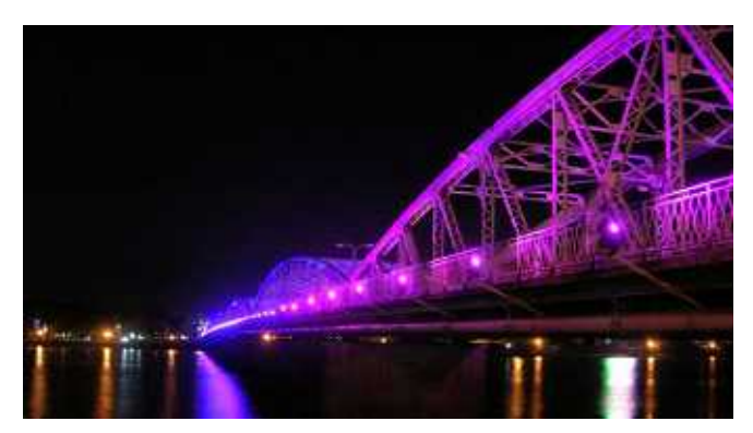
Trung Tien Bridge, one of symbols of Hue city, with lighting up across the Huong River which is water source for Hue city

As shown in the table, COWASU is running its business well with good collection rate of water charge. COWASU has grown up ability of staff and organization itself by two international technical cooperation programs: JICA Partnership Program (done by Yokohama Waterworks, 2003 to 2006) and JICA Technical Cooperation Project (supported by mainly Yokohama Waterworks,