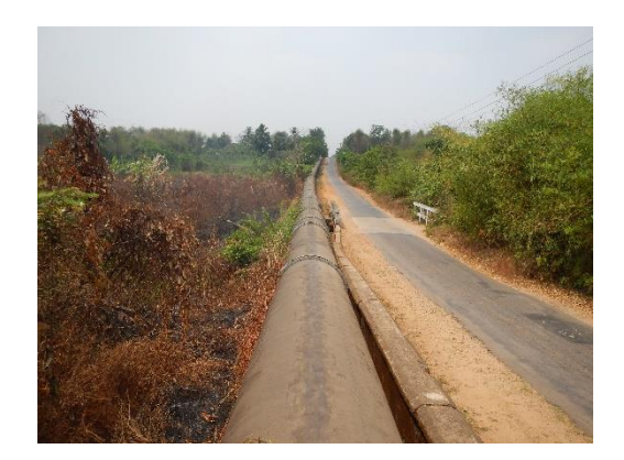
Figure 6 Gyobyu pipeline

[Issue 2] The amount of unregistered connections was estimated 59,000 m³/d. 1.9 billion Kyat would be lost every year for them. I suggested that they find other unregistered ones by regular inspection and then install water meters for collecting water charges based on the water consumption.