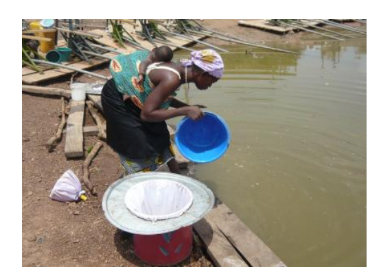
Picture2: woman fetching pond water under the blazing

Safe water supply coverage in rural area of Northern region was about 58% (CWSA 2006). This means at least 42 % of local residents in rural area use only pond and stream for drinking water. It was very shocking scene for me when I saw, first time, a woman fetching pond water for drinking, sweating under the blazing sun. This experience is one of my strong motive powers to work in the field of water.