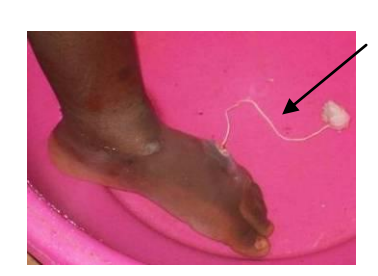
Picture1: Guinea Worm

I was dispatched to Ghana as a water resource development junior expert of Japan Overseas Cooperation Volunteer (JOCV) for Guinea Worm Eradication Program (GGWEP) operated in the rural area of Northern region of Ghana, for 2 years from the end of March, 2008. Guinea Worm (GW) is a disease that person is infected when he or she drinks pond water contaminated by larva of GW directly. GW is not a fatal disease. However, if person is infected, full grown GW (approx 1 meter) comes up from foot and so on completely with strong pain. It takes for one month to remove GW. Most of cases, children are infected with GW, and during time of removing GW from their body they cannot go to school. One of the solutions to eradicate GW is that local residents access to safe water (not to drink the pond water directly). I had worked in the field of safe water supply especially aspect with the purpose of for technical improvement of safe water accessibility of local residents, and eradication of GW.