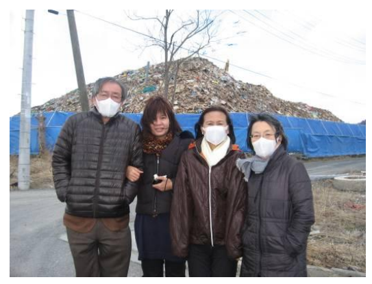
In front of debris mountain

The building was mostly blackened by a fire caused by a drifted car crashing to gas cylinders resulting in involving following several cars to be burn with.