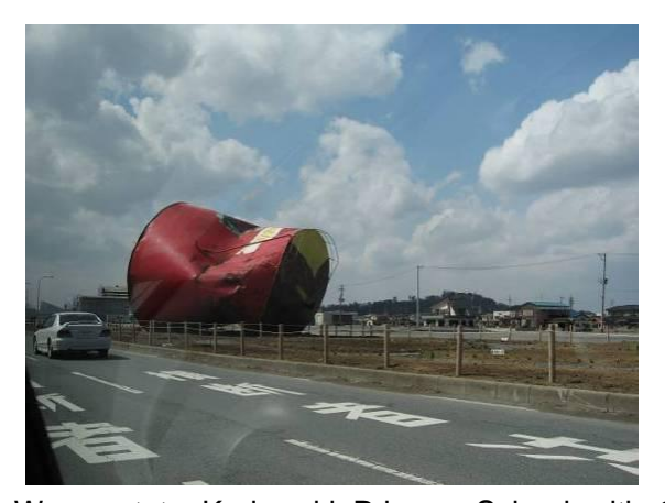
We went to Kadowaki Primary School with 30 classrooms in 3-stories building at the foot of mountain in Kadowaki, Minamihama District.

Huh? Did anyone throw a Coke can away? No, it's too big! As getting closer to it, we found that was a dented huge tank. The tank seemed to tell us the message to remind us of the terrible situation of that time.