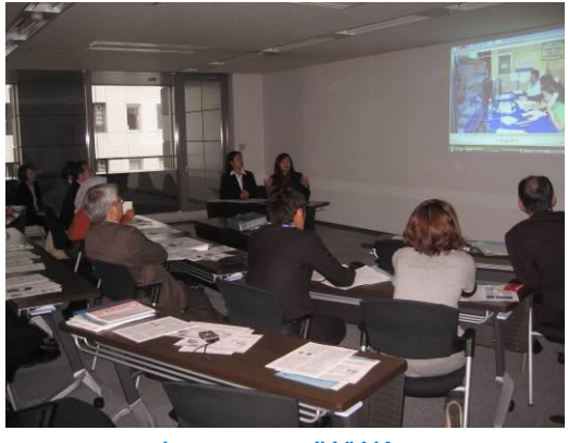
Lecture at JWWA

Anyway, we had enjoyed the petit-seminar and