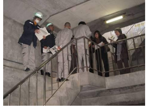
Inside of Anyoji distribution reservoir

strong in itself, therefore some structures suffered serious damage depending on construction age, condition of location and nature period of structure.