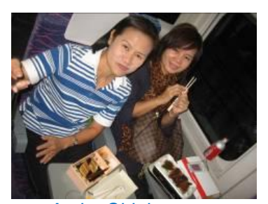
At the Shinkansen

The following days, we visited Sendai coastal areas, Ishinomaki, where were heavily hit by the March 11 quake and tsunami.